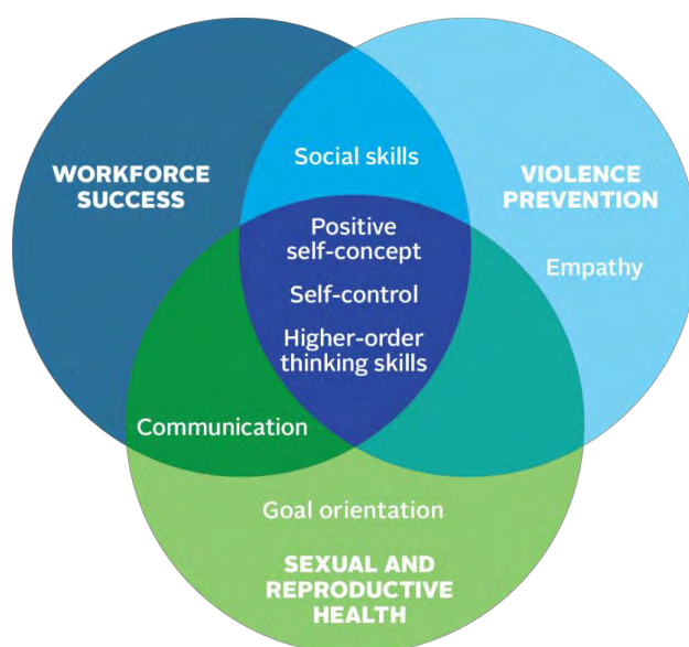
Figure 1. Cross-Sectoral Skills for Youth Development: Top Supported Skills Across Fields

Positive self-concept refers to “a realistic awareness of oneself and one’s abilities that reflects an understanding of his/her strengths and potential (and hence, is, positive)” (Lippman et al., 2015). In addition to being an important intrapersonal skill for workforce success, positive self-concept is supported by empirical evidence and experts in the field as an important skill for preventing different forms of youth violence. Positive self-concept enables youth to walk away from a fight, or successfully navigate challenging tasks and situations at work. Experts highlight that the effects of positive self-concept on violence prevention outcomes may operate through different mechanisms and may differ depending on the context.