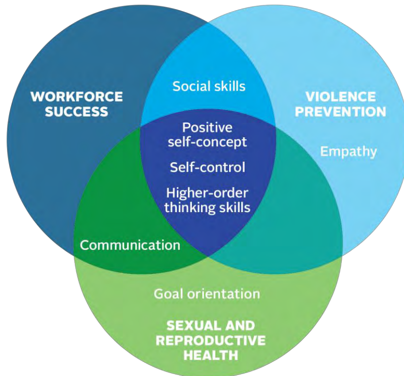
Figure 4. Cross-Sectoral Skills for Youth Development: Top-Supported Skills Across Fields

Two additional skills emerged from the review of SRH and violence prevention that were particularly important to those fields, although not present among the top 10 skills for youth success in the workforce. Empathy emerged as the skill with received the third strongest base of support in the violence prevention literature, while goal orientation emerged as the skill that received the fourth strongest base of support in the SRH literature. Figure 4 shows all seven skills according to outcome area.